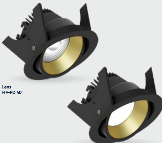
Lens HV-FD 40°